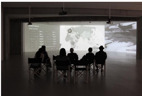
THE UNENDING LIGHTNING, 2013-15, 3 Kanal Video Installation, Hauptausstellungsraum