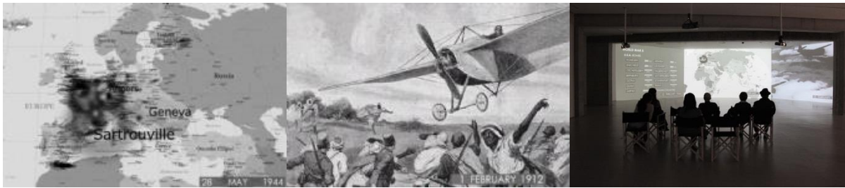
FROM THE SKY DOWN, video stills, 2013 @ OK