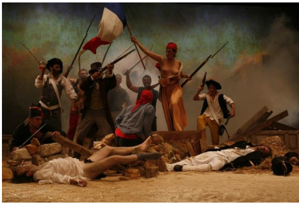
LA LIBERTÉ RAISONNÉE, Video Still, 2009