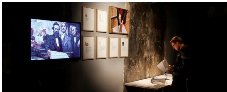
SURPLUS VALUE, 2014, Video Installation